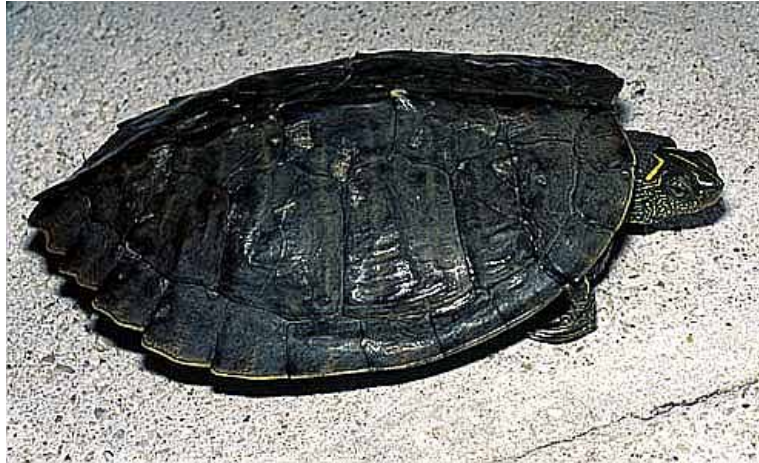
False map turtle ( Graptemys pseudogeographica )

BEFORE THE OKLAHOMA WILDLIFE CONSERVATION COMMISSION, GOVERNOR OF OKLAHOMA, AND THE OKLAHOMA DEPARTMENT OF ENVIRONMENTAL QUALITY